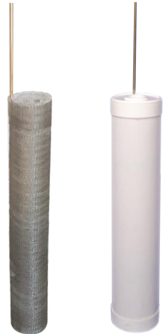
Non-captive (left) & captive (right) cartridges

Cost efficient alternative : simple electrum SIRELEC 53198 without rectifier with non-captive cartridge ref. 19660.